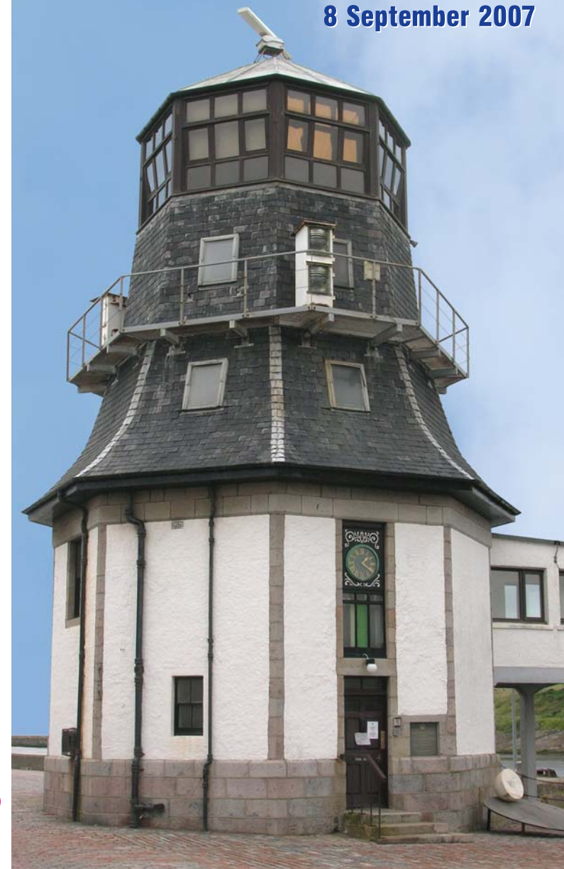
Cover: 31 The Roundhouse