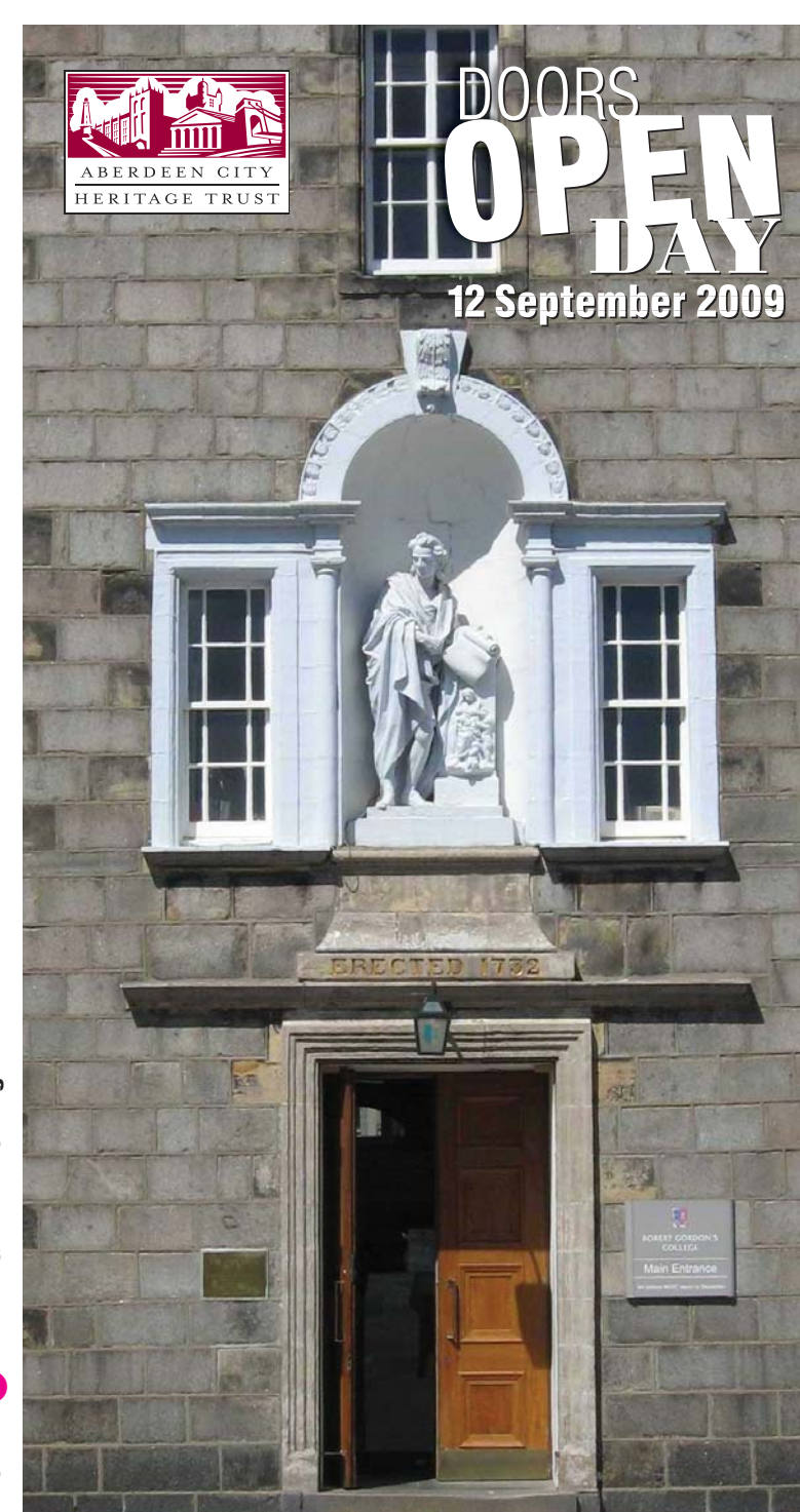
Cover: 15 Robert Gordon's College