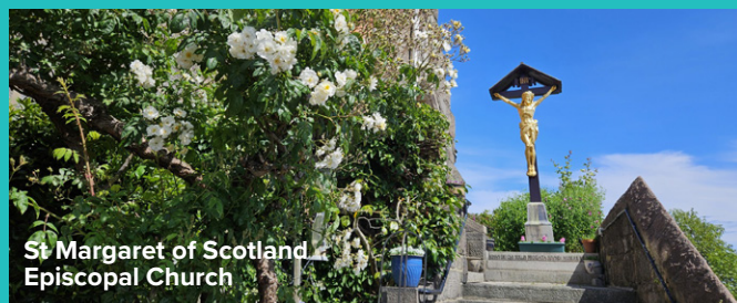
St Margaret of Scotland Episcopal Church

Last minute alterations and additions to this programme may be unavoidable. Keep up to date by visiting www.facebook.com/aberdeendoorsopenday and www.doorsopendays.org.uk . Please take care when visiting buildings, which you do at your own risk. Neither the Local Area Coordinator, sponsors or the building owners take responsibility for any accidents or damage.